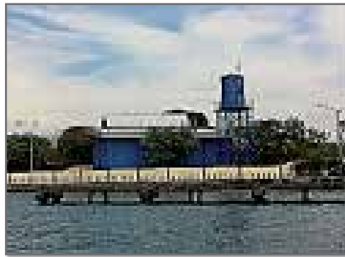
The table below shows performance since commissioning.

Ever since commissioning the plant in May 2015, HYDRAcap®MAX membranes needed recovery cleans only twice with citric acid. The SWC5-LD membranes have been cleaned only once at high and low pH. This proves the efficacy of the HYDRAcap®MAX pre-treatment and that of LD Technology® in requiring reduced number of cleanings.