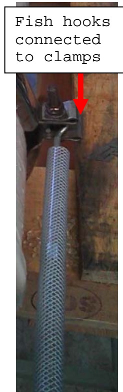
Figure 3: Fish hook connection points on clamps.