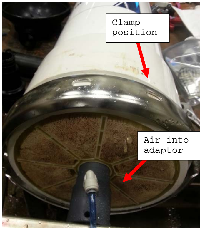
Figure 2: Clamp and air inlet locations.