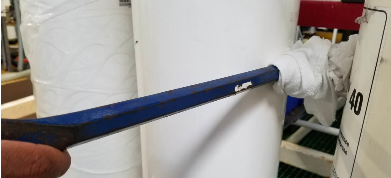
Figure 3: Crowbar with padding to separate modules.