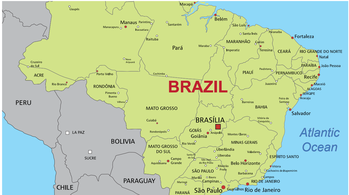
B R A Z I L

seawater formed scales with the barium and strontium present in the oil formation water. Sulfate reducing bacteria also reacted with the injected seawater sulfates causing souring of the oil and corrosion.