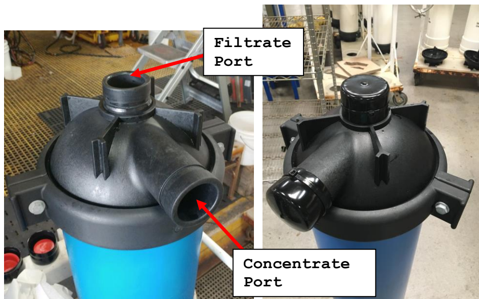
Figure 2: Module standing on end showing port locations.