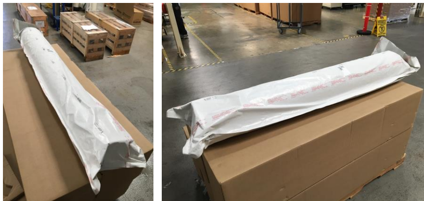
Figure 3: Element Sealed in a chemical resistant vacuum bag.