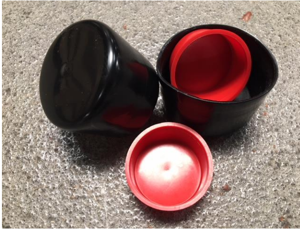
Figure 1: Photo of original plugs and end caps.