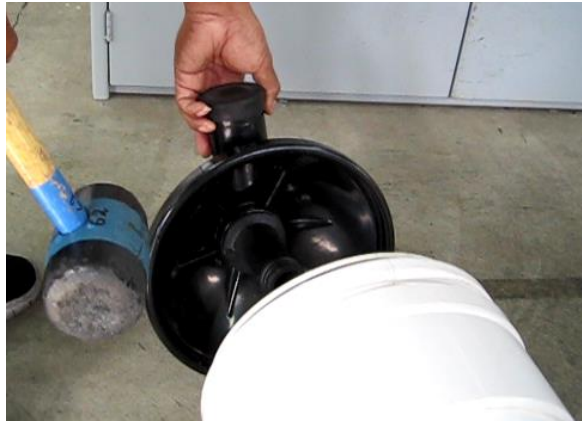
Figure 4: End cap being separated from the module after tapped with a rubber mallet.

NOTE: Do not use any metallic tools to loosen shell. Shell and end cap are made from plastic and irreversible damage on sealing surfaces may occur.