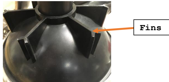
Figure 6: Picture of the end cap fins to stike with rubber mallet when installing on the element.