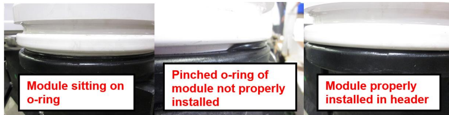
Figure 8: Example of module sitting on o-ring, pinched o-ring, and module sitting properly in header.