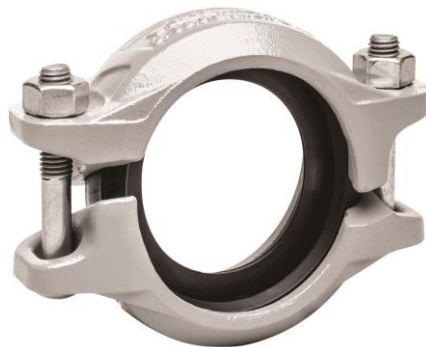
Figure 1: Example of port connection Victaulic clamps.