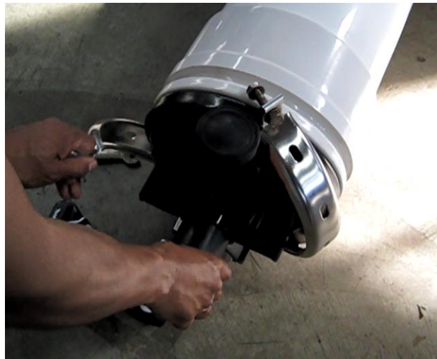
Figure 3: Removing the end cap clamps.