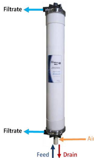
Figure 7: Align the filtrate ports so they are facing the same direction.