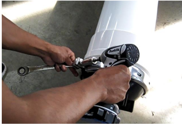
Figure 2: Loosening of the end cap clamps.