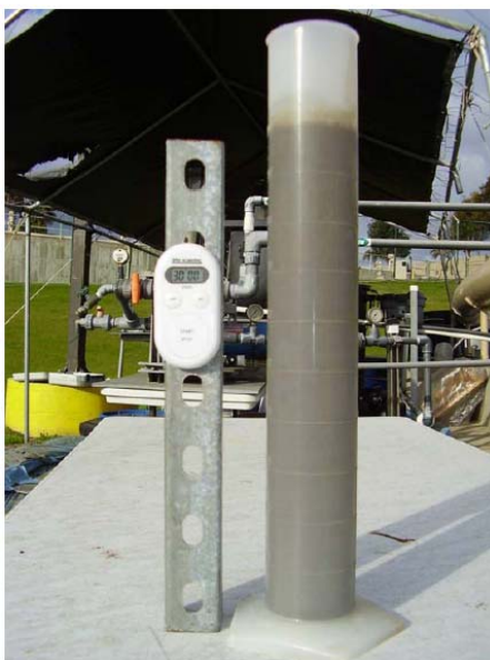
Figure 1. SV30 test set-up