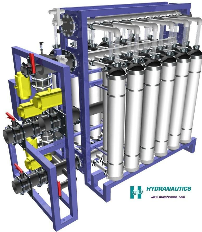
Figure 2: Sample Rack Assembly