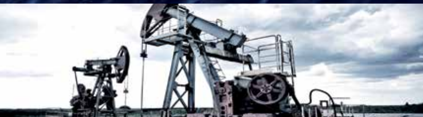
CONVENTIONAL PRODUCTION, IOR & EOR