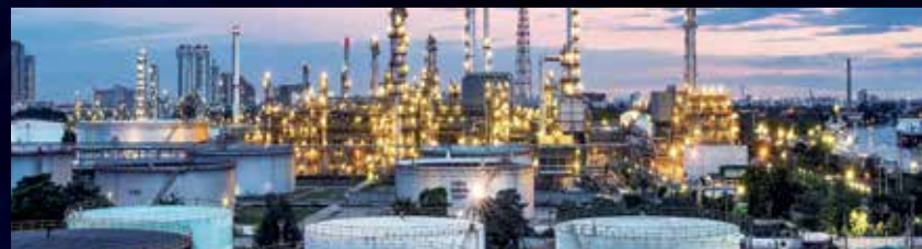
DOWNSTREAM OIL & GAS