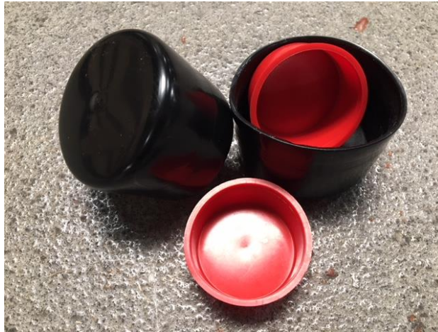
Figure 5: Module port caps and plugs.