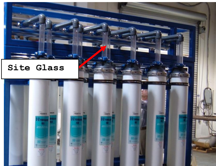
Figure 2: Clear PVC site glass.