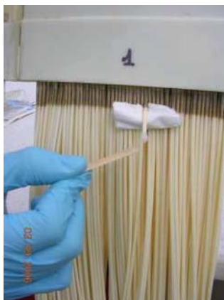
Figure 2. Application of epoxy