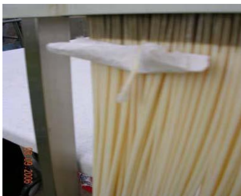
Figure 3. Drying of fiber