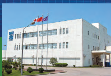
Nitto, Shanghai – China